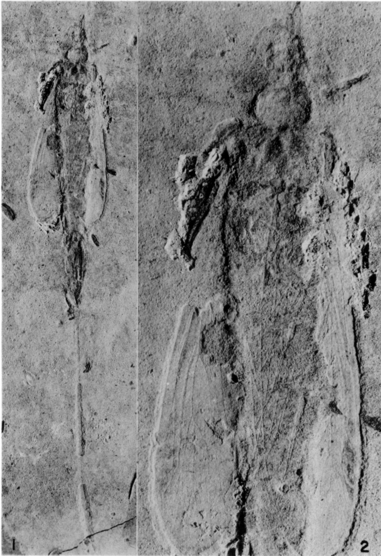
FIG. 1. Photograph of Euchoroptera longipennis , n.sp. (holotype, X 1.7). FIG. 2. Photograph of head, thorax and wings of same specimen (X 5).